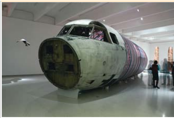
Above & below Huang Yong Ping Bat Project IV, 2004-2005 airplane cockpit, bamboo scaffolding, plastic construction fence, taxidermic bats, documents, photographs

life-sized US spy plane (alluding to an incident in 2001 when one such jet collided with a Chinese "Bat" plane and set off a major diplomatic incident) is festooned with 300 stuffed bats (I completely got over my fear of bats in this fiesta of taxidermy and angry activism) and The Nightmare of